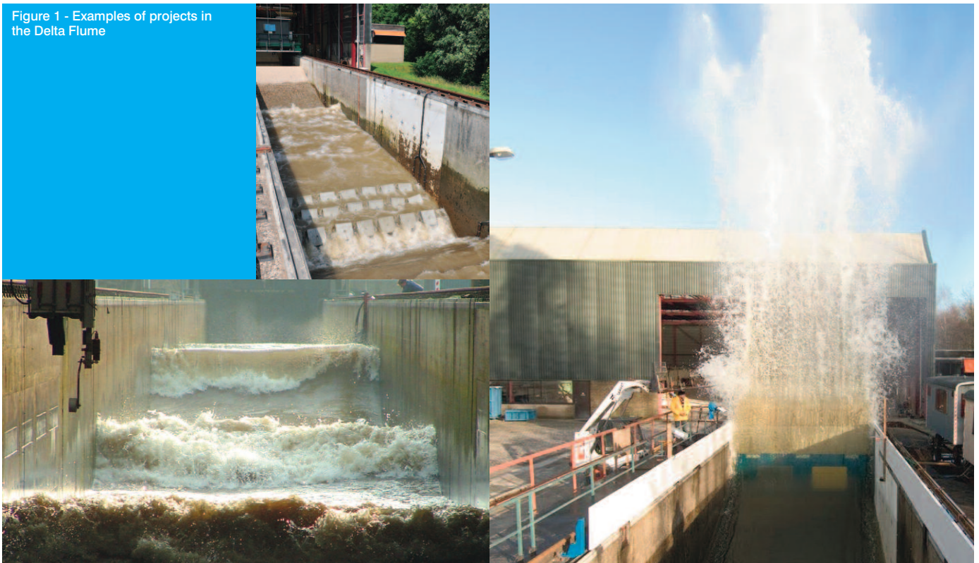
Figure 1 - Examples of projects in the Delta Flume

Examples of materials that cannot be modelled properly at a small-scale are sand, clay, grass or natural construction material (e.g. brushwood). Physical processes that cannot be modelled properly at a small-scale are often related to flow characteristics that do not scale according to Froude's scaling law, e.g. for structures in which laminar (porous) flow plays an important role results may be affected by scale-effects. Nevertheless, tests at small-scale can provide valuable indicative results although for accurate quantitative results large scale models are still