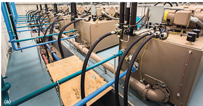
(a) hydraulic power units for wave generator (b) crane above flume to construct structures to be tested (c) blue wave paddle